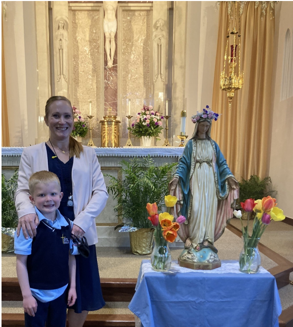
Kindergarten Celebrating May Crowning

Technology: ISTE standards are used to teach technology. All students have their own device. K & 1st have iPads; 2nd - 6th have Chrome books. Integration of technology and computer use into the curriculum at every grade level exists for each classroom. https://www.iste.org/standards