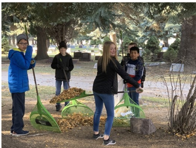
Cleaning up at Rose Hill Cemetery