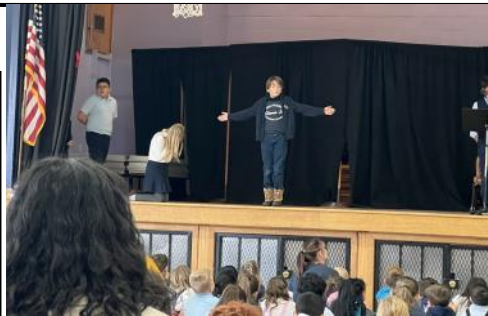
Live Stations of the Cross