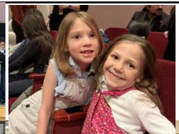
Jig Jam field trip!